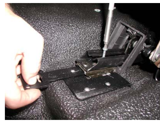
Slide guide brackets into seat rail and loosely attach #10 x 3/4" Phillips pan head machine screws